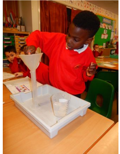
Photos from Year 2 investigation

Reception have been doing a flurry of investigations such as melting ice and seeing the different concentrations of water, in addition to this they have also been arranging different dinosaurs into groups of species.