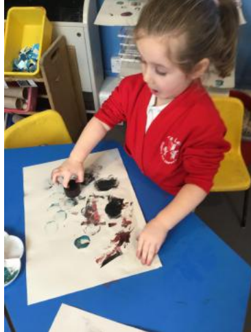
w. b 14.11.22

This week in Nursery children are celebrating World Nursery rhymes week. We had a dressing up day on Monday and we came to school dressed as a character from our favourite Nursery rhyme character. We have spent lots of time listening to and joining in with singing well