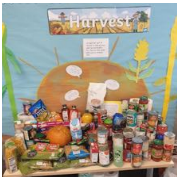
From Isobella Crooks

for food. Did you know that it is normally celebrated on a Sunday when it's nearest to the appearance of the Harvest Moon (this is the full moon that appears closest to the autumn equinox, which is usually at the end of September or the beginning of November)? Harvest festivals are to celebrate the foods that are grown in the ground. The school children, and their adults, at The Leys have worked hard to collect some lovely fruits, vegetables and canned foods!