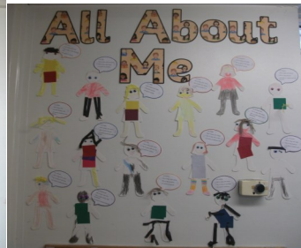
Our new Reception pupils are real stars!

THE LEYS LEARNING VALUE Autumn 1 self-belief